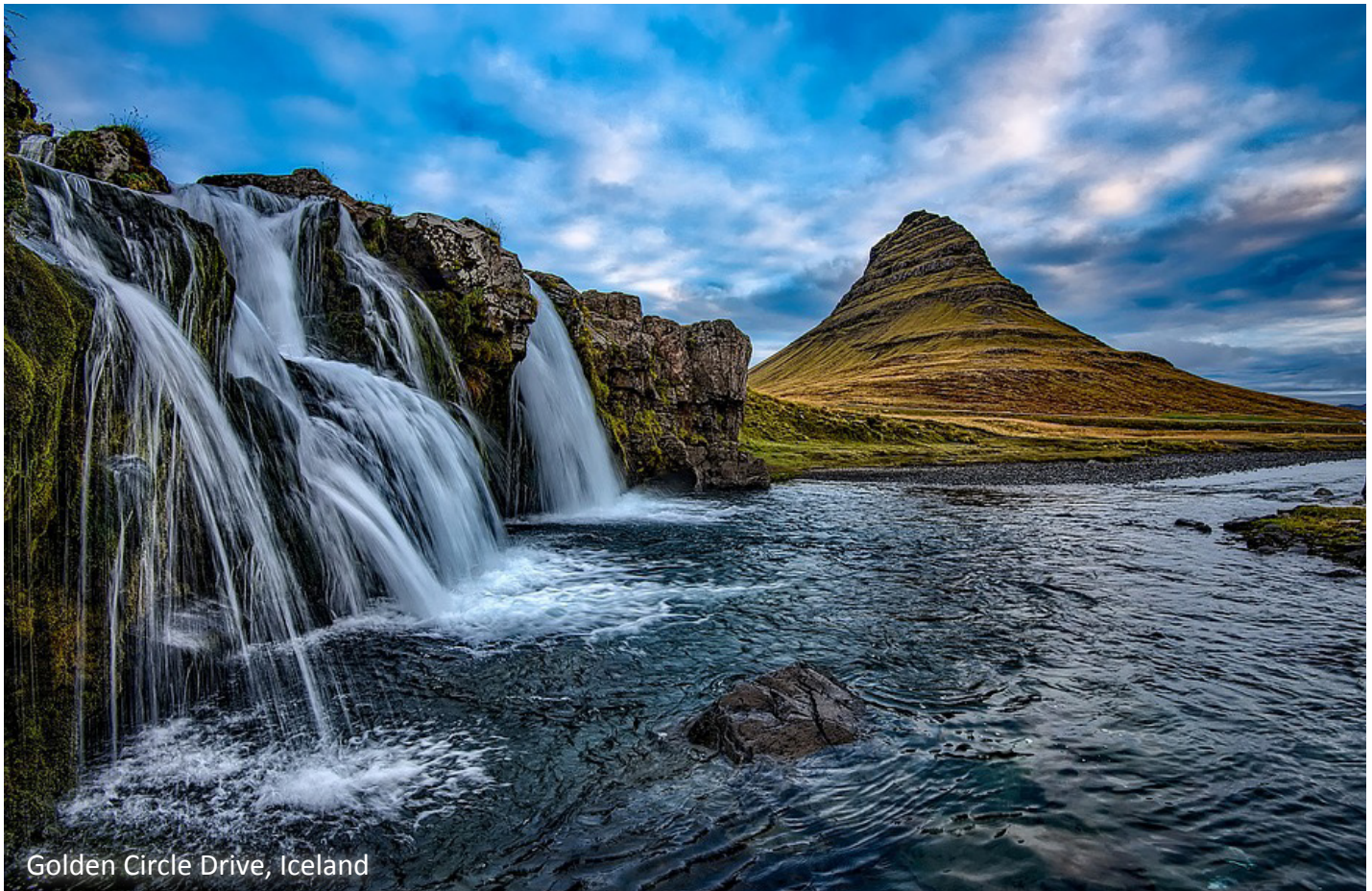
Golden Circle Drive, Iceland